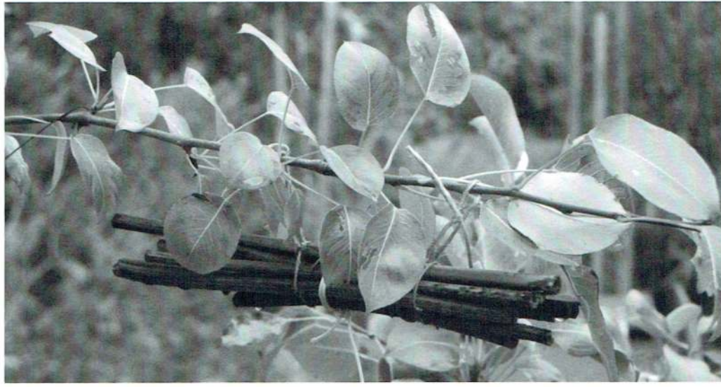
Figure 5. Bundles secured to small tree limb.

Hopefully, by the end of the reproductive season (spring / summer) you will see signs of bees inhabiting your nesting bundles, with some of the pithy centres having been excavated (Figure 6).