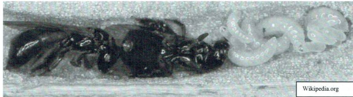
Figure 1. Exoneura bees, adult and immature stages, within a single cavity of a plant stem.

Exoneura bees range in size from 5 to 8 mm in length and live in semi social groups, with two or more reproductive females (queens) within a single nest. As with all solitary or semi social bees, Exoneura do not store honey in their nests. Adult female bees burrow into the pithy centre of dead plant stems, such as the exotic weed Lantana or native Tibouchina , and make a nest. Exoneura are unusual in that they mass rear their young within a single cavity (Figure 1) and do not create individually partitioned cells for each off spring, as do most solitary bees.